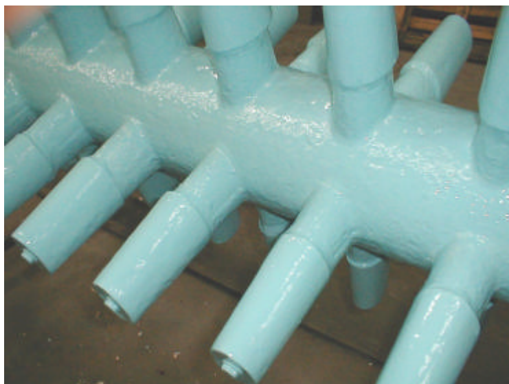
RESINE ANTI ABRASION