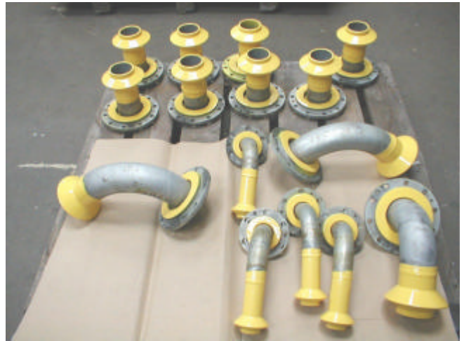
EPOXI ANTI CORROSION